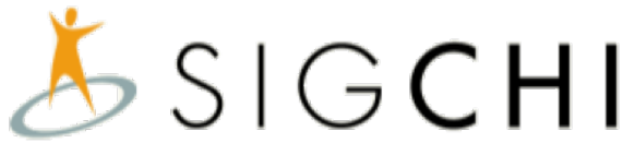
Figure 1. Insert a caption below each figure. Do not alter the Caption style. One-line captions should be centered; multi-line should be justified.