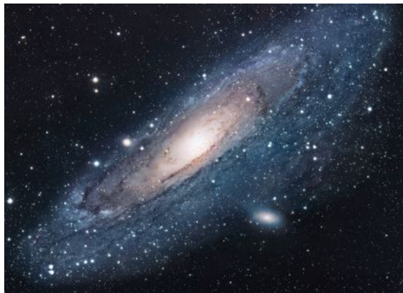
Figure 2.1: Artistic view of the Milky Way

In an essay, article, or book, an introduction (also known as a prolegomenon) is a beginning section which states the purpose and goals of the following writing. This is generally followed by the body and conclusion (see 2.1).